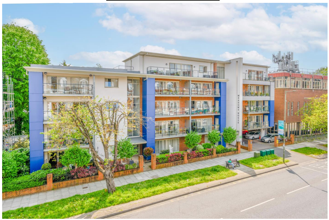
18 Meadows House New Zealand Avenue Walton-On-Thames Surrey KT12 1PG £1595pcm + Initial deposit